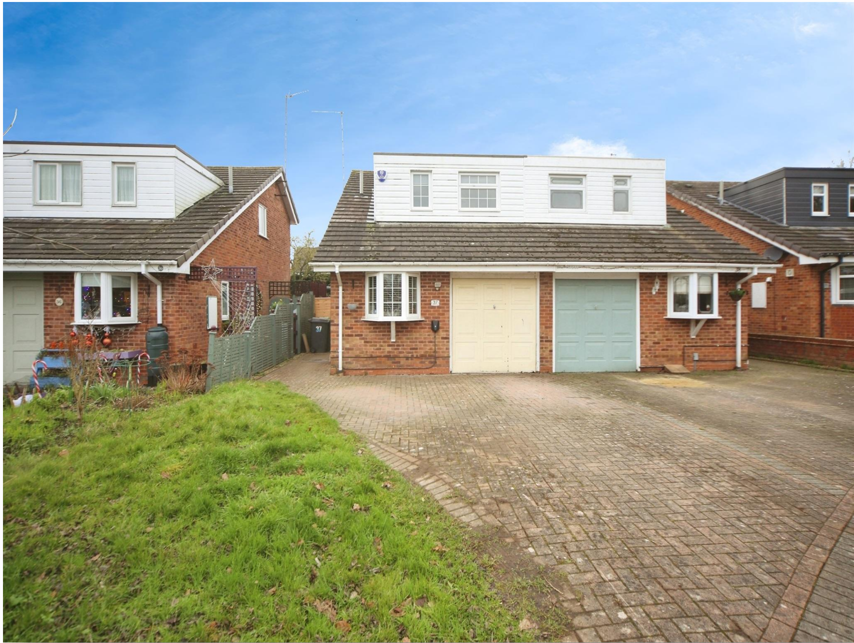
Kingscote Close, Redditch B98 9LJ