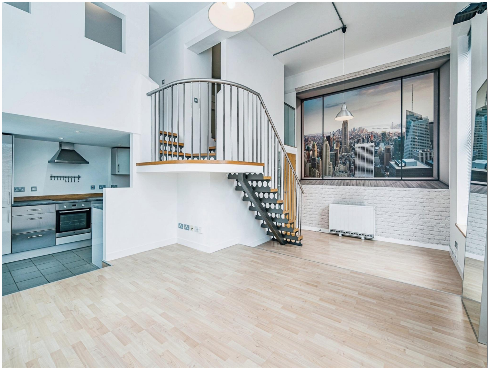
Parsons Street Metropolitan Lofts, Dudley DY1 1JE