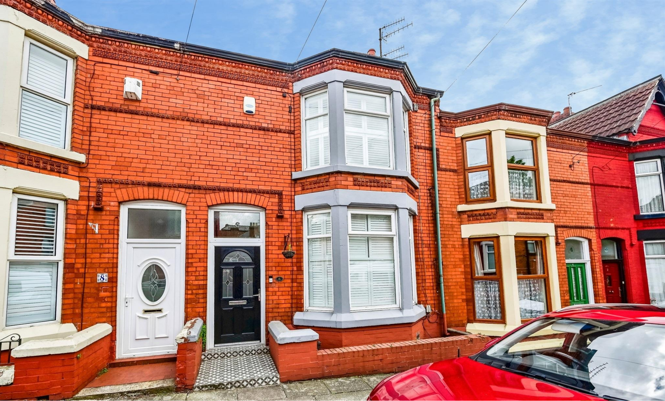
Lucan Road, Liverpool L17 0BS