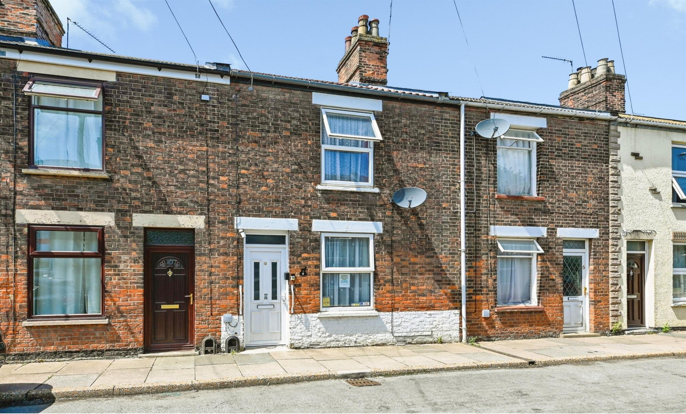
Diamond Street, King's Lynn, PE30 5LX