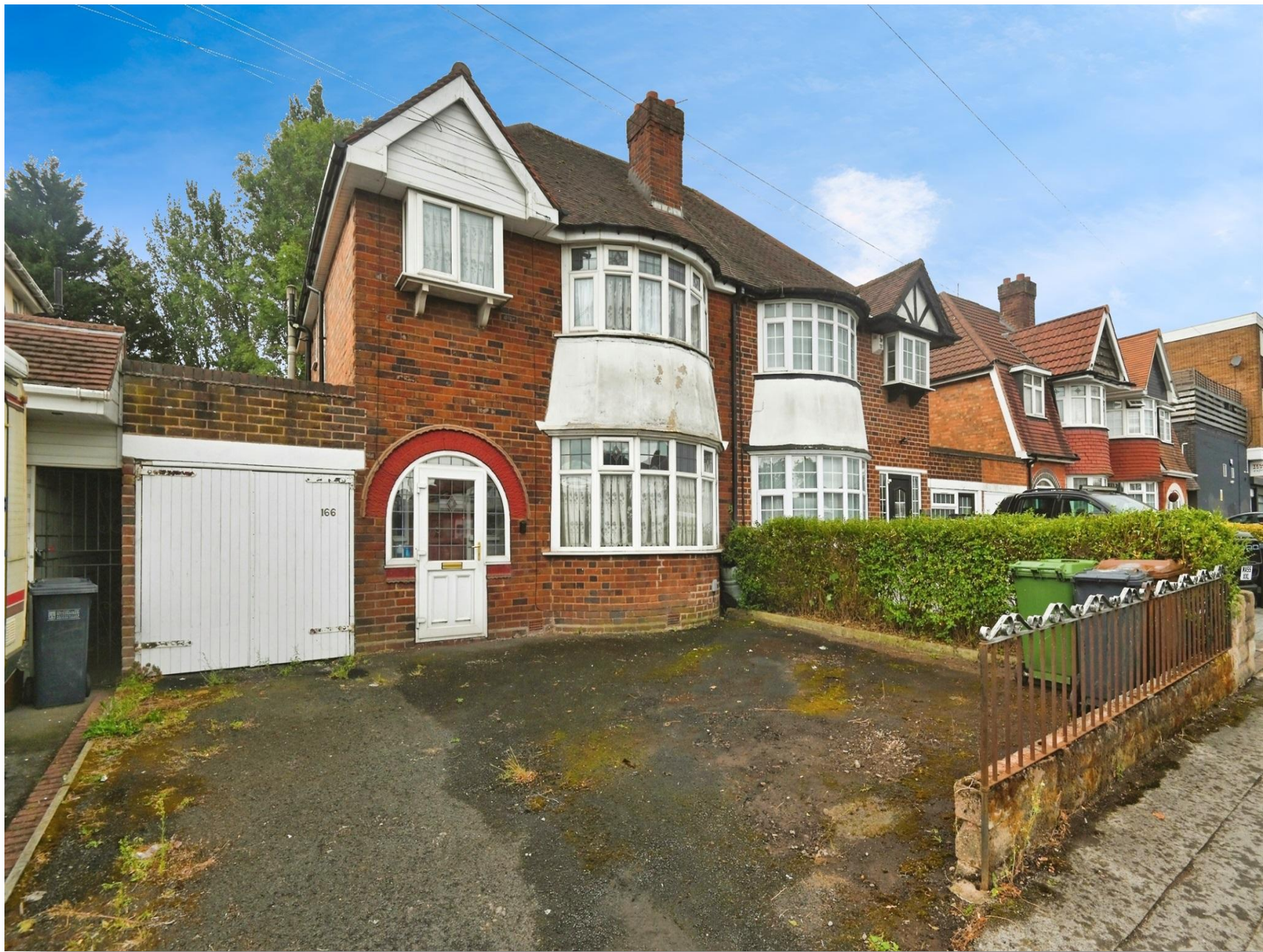
Chester Road, Castle Bromwich Birmingham B36 0JE