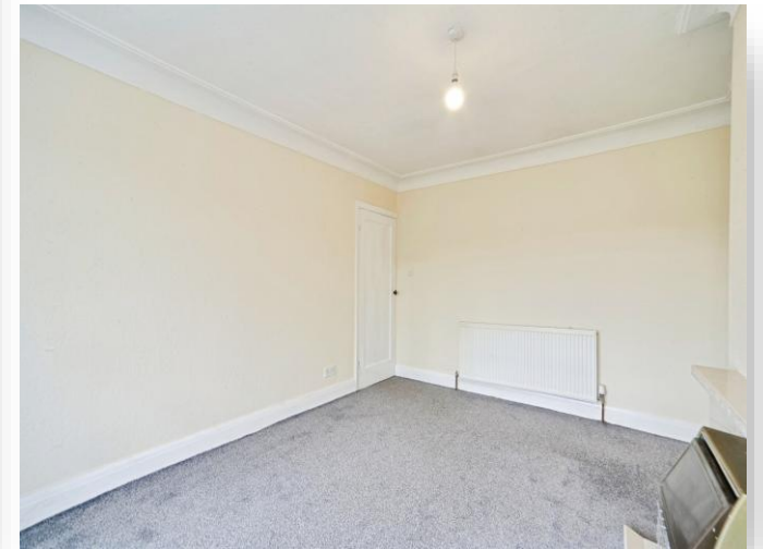
Harden Lane, Wilsden Bradford BD15 0EZ