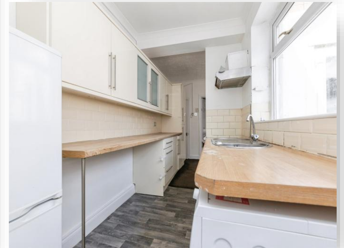
Bright Street, Hartlepool, TS26 8JY