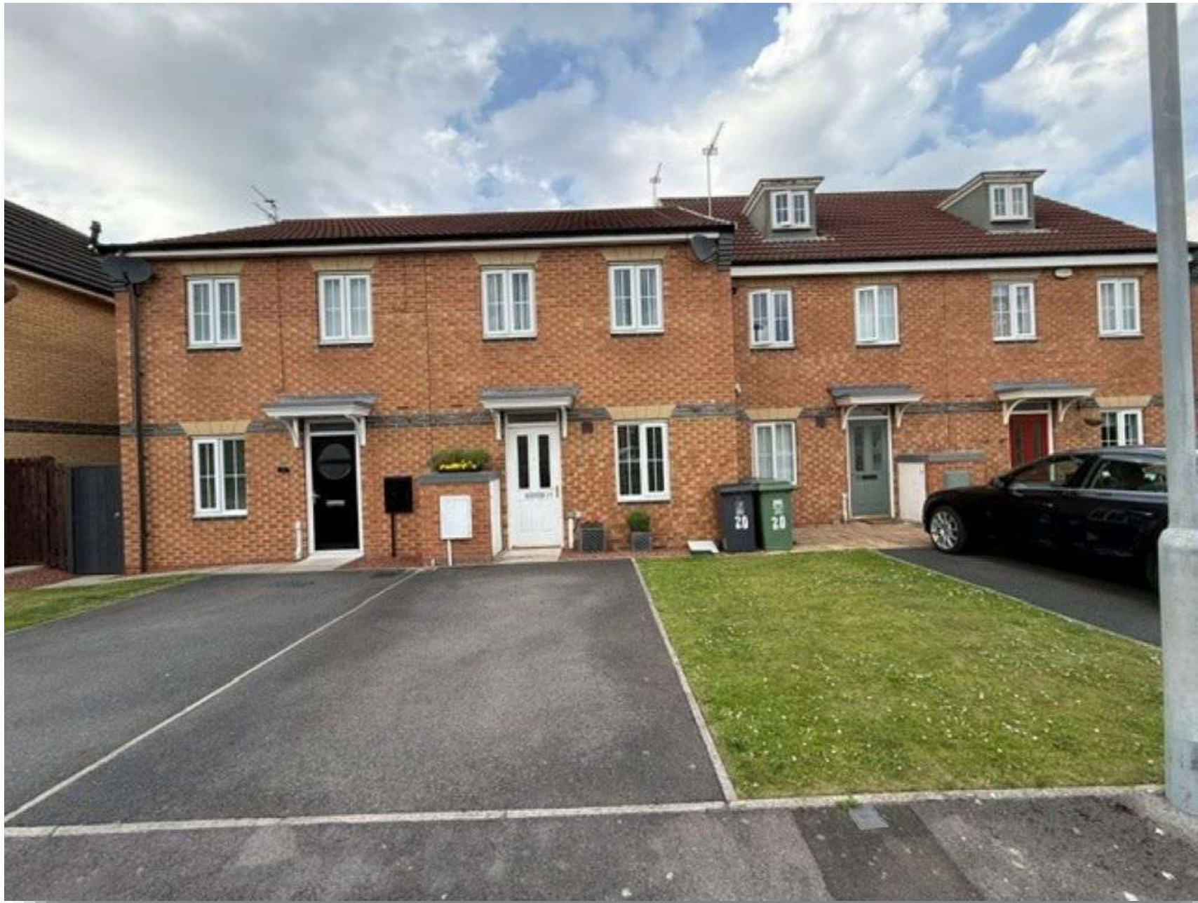
Hartoft Square, Hartlepool TS26 8GB