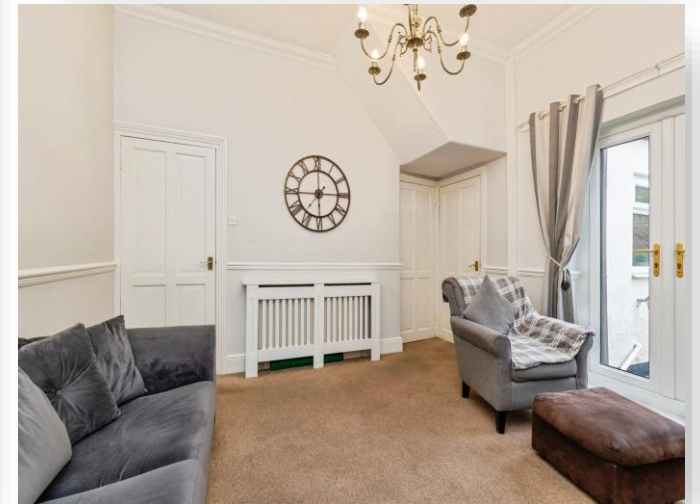
Thornhill Gardens, Hartlepool, TS26 0HX