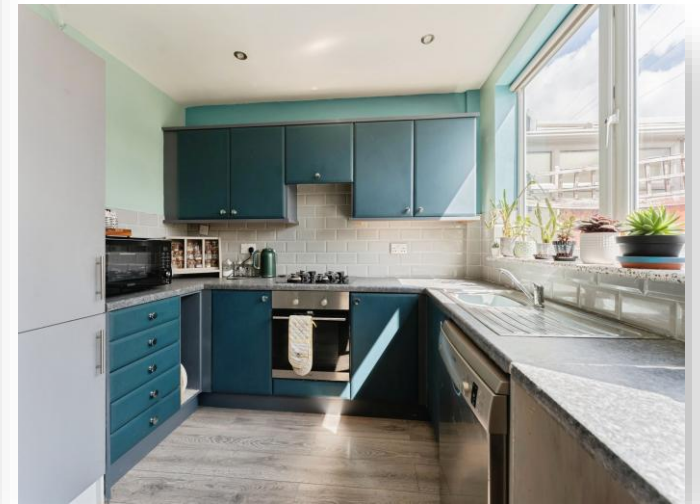
Chester Road, Whitby Ellesmere Port CH66 2LJ