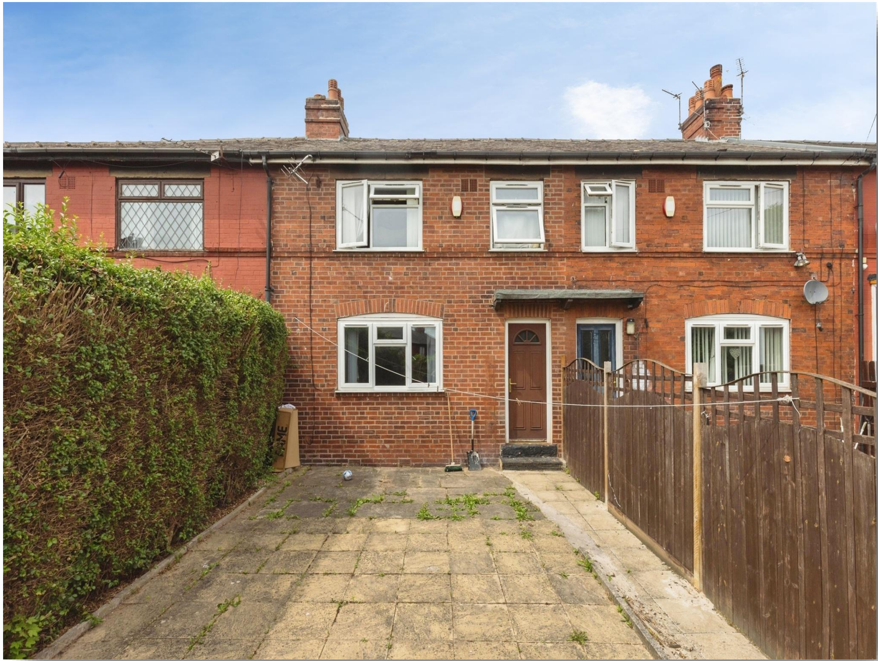
Temple View Grove, Leeds LS9 9LH