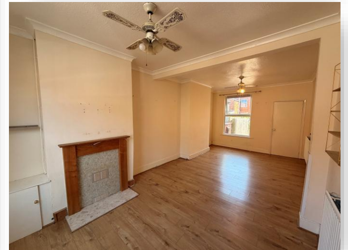
Cloutsham Street, Northampton NN1 3LN