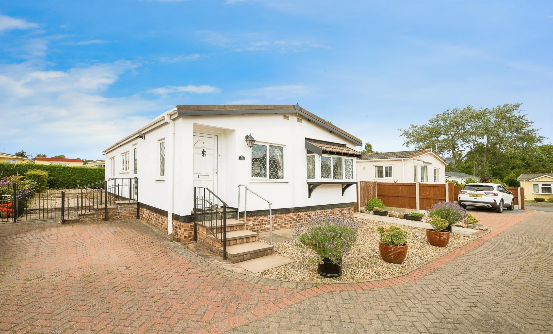
Orchard Park, Elton Chester CH2 4NG