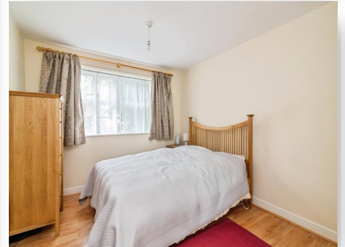
Hawthorn Lodge Julian Road, West Bridgford Nottingham NG2 5AJ