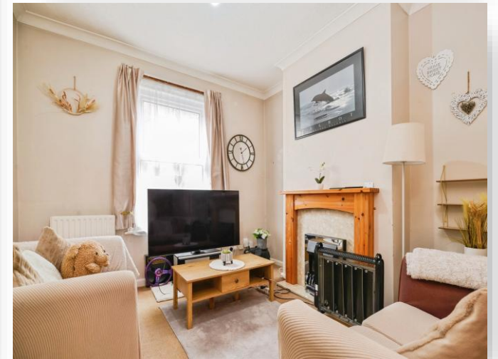
Norfolk Street, Stockton-On-Tees TS18 4BB