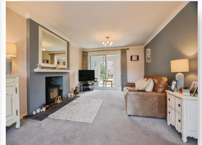
Town Farm Close, Bishopton Stockton-On-Tees TS21 1HX