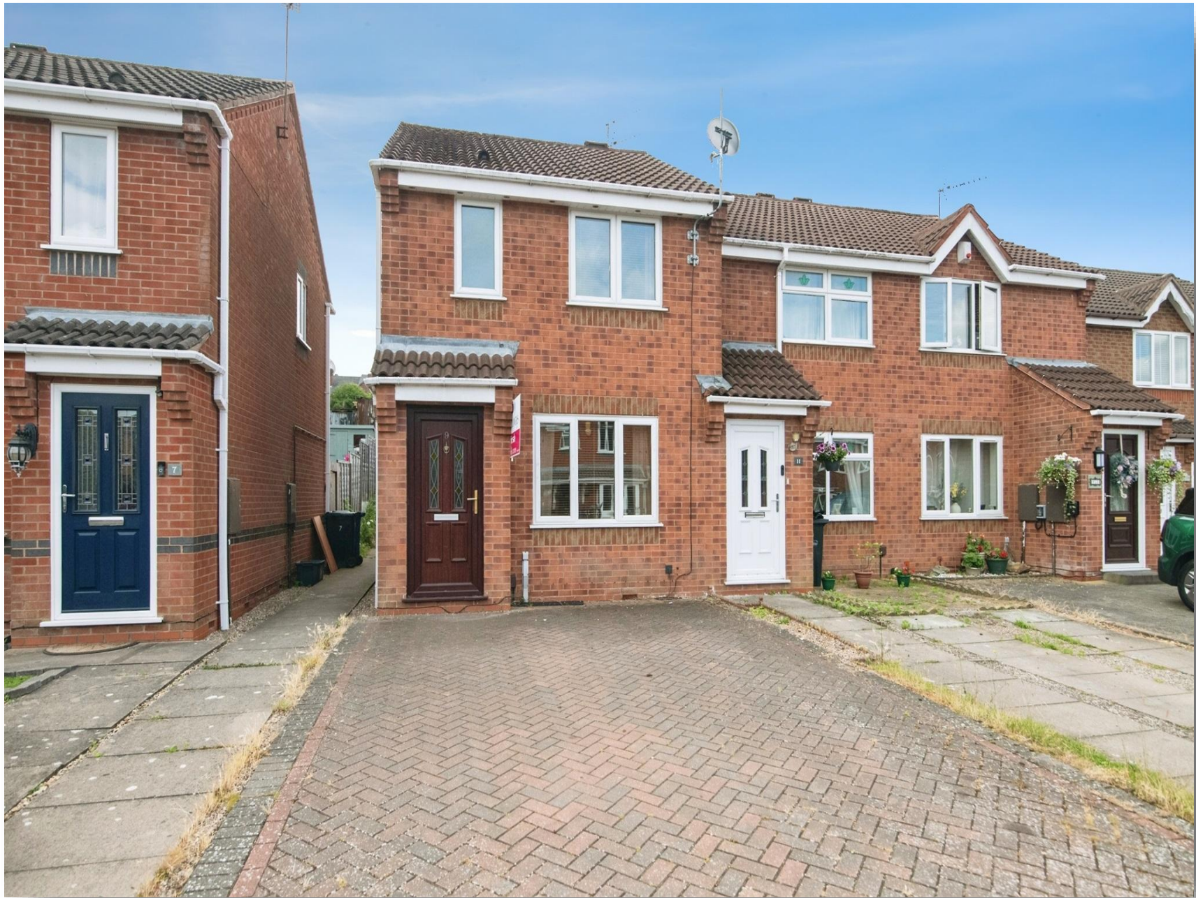
Denbigh Close, Dudley DY1 2RJ