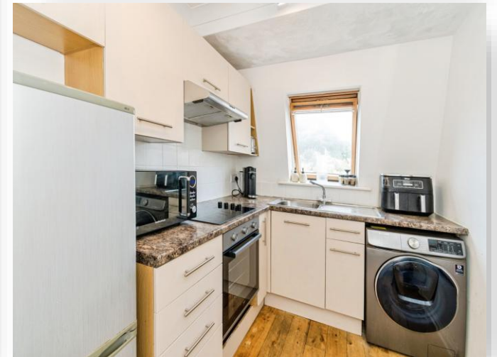
Grenville Court, Old Farm Drive, Southampton SO18 2QH