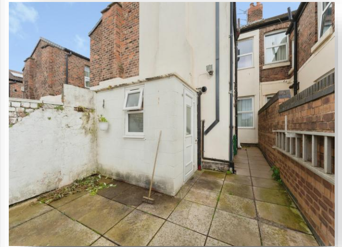
Cloughton Road, Birkenhead, CH41 4DX