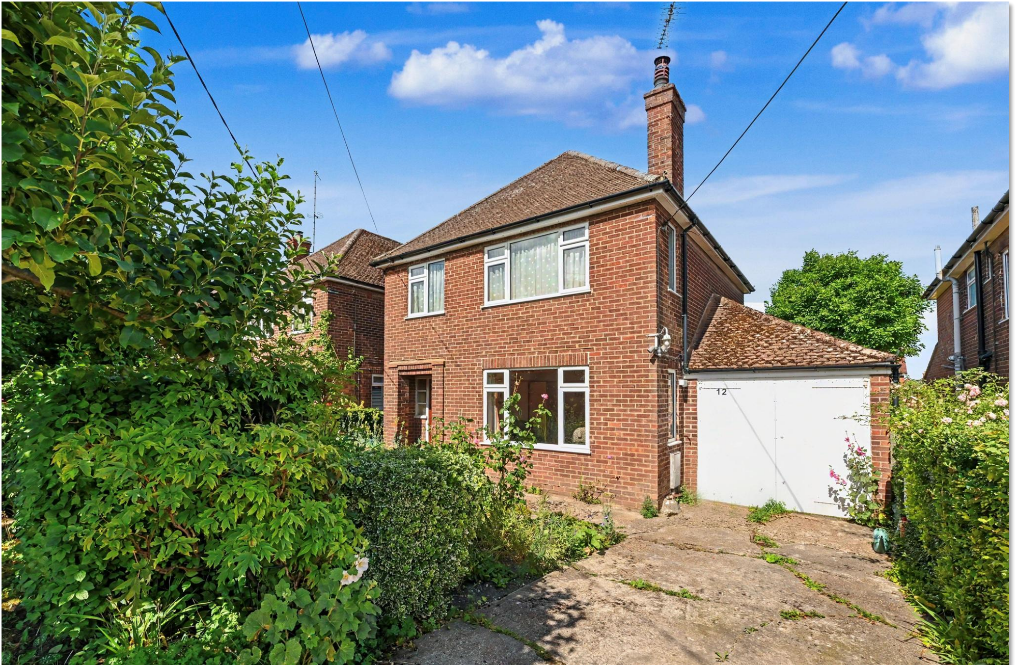
Church Road, Pitstone Leighton Buzzard LU7 9HA