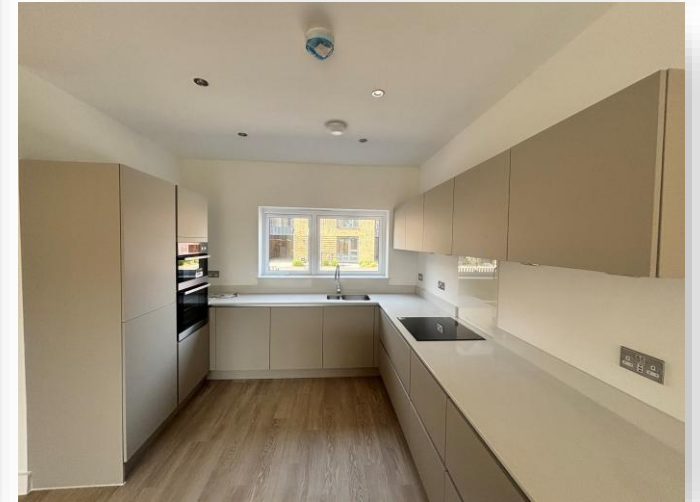
The Athens Abbey Road, West Bridgford Nottingham NG2 5NE