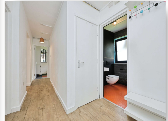
Uplands Court Upton Road, Norwich NR4 7PH