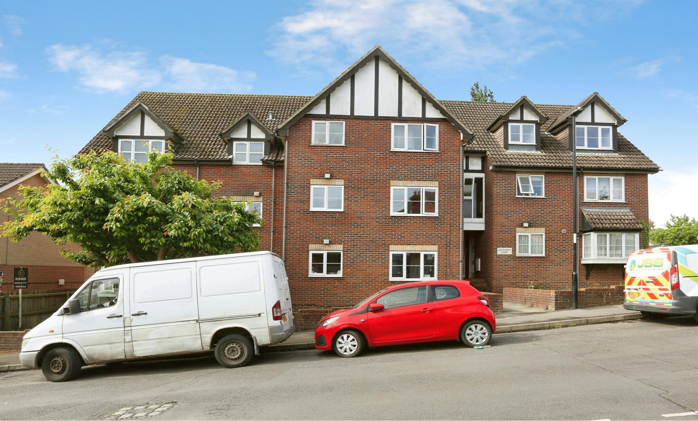
Westmarch Court, Kitchener Road, Southampton SO17 3SF