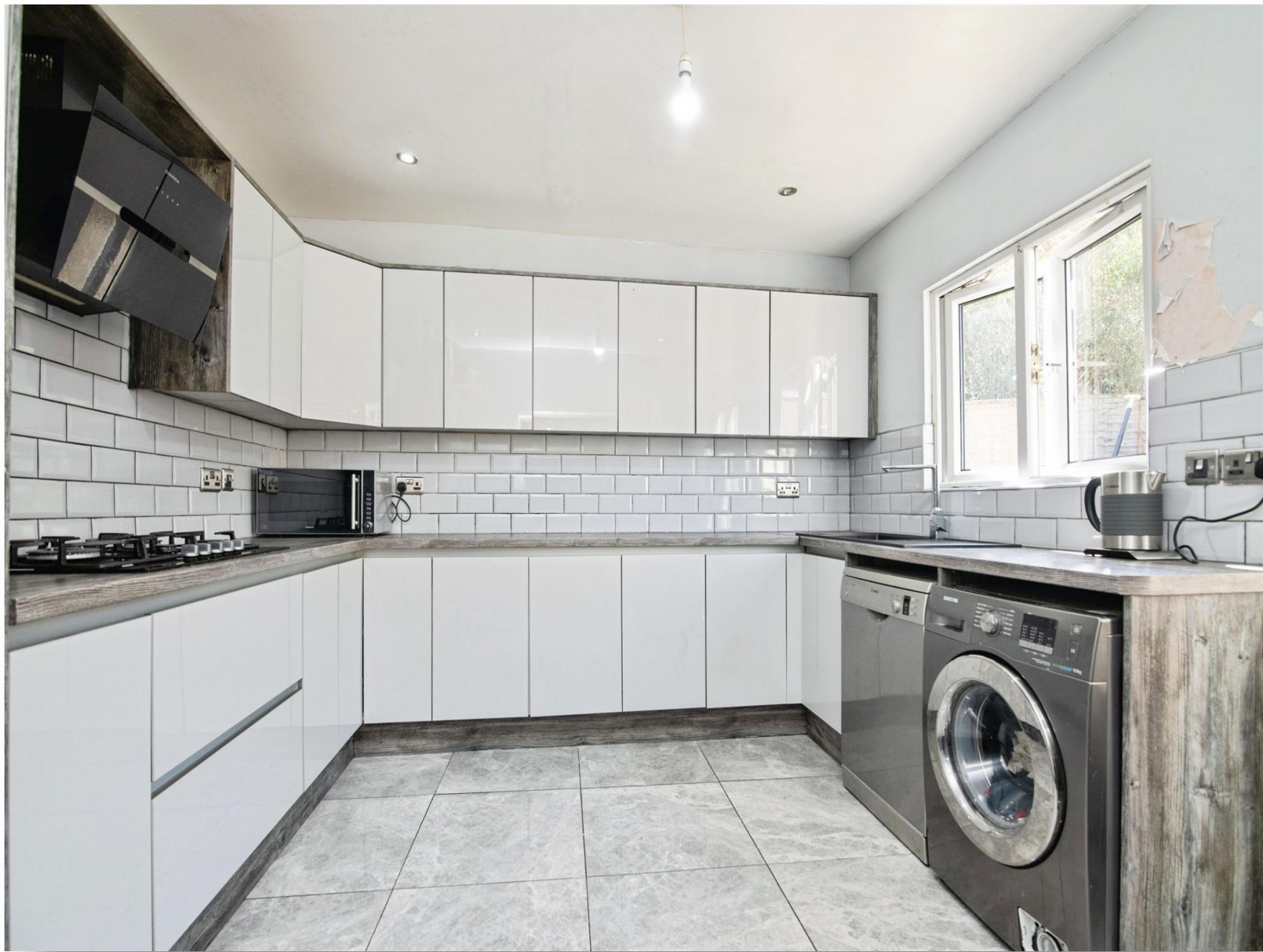
Halsbury Grove, Birmingham B44 0DU