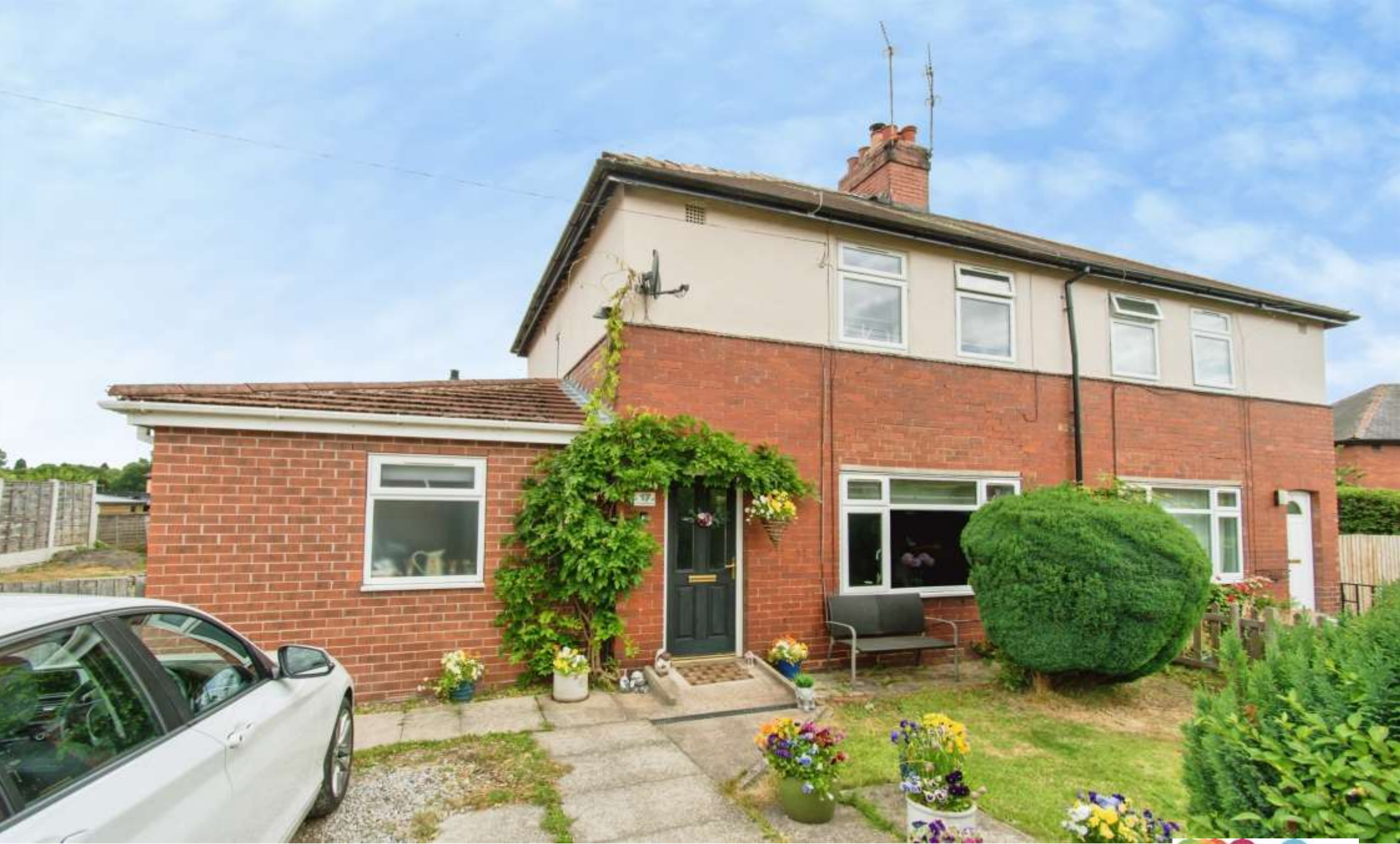
Chapel Garth, Ackworth Pontefract WF7 7NQ