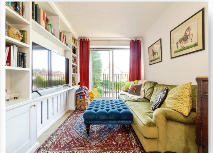
Mansfield Court, Mansfield Gardens, Hertford, SG14 3EU