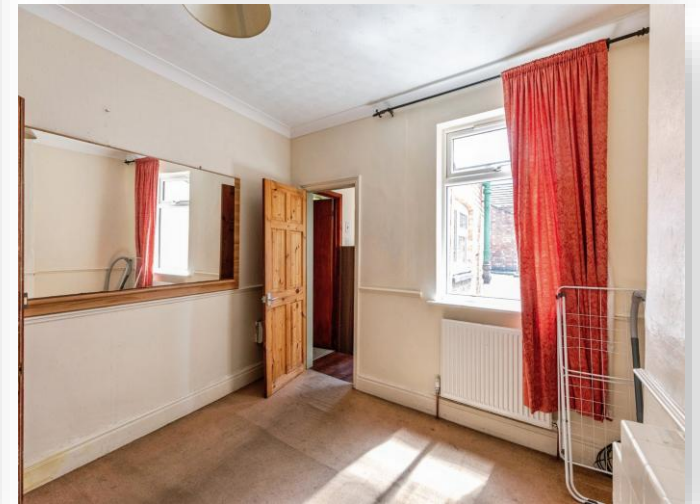
Gold Street, Wellingborough NN8 4QT