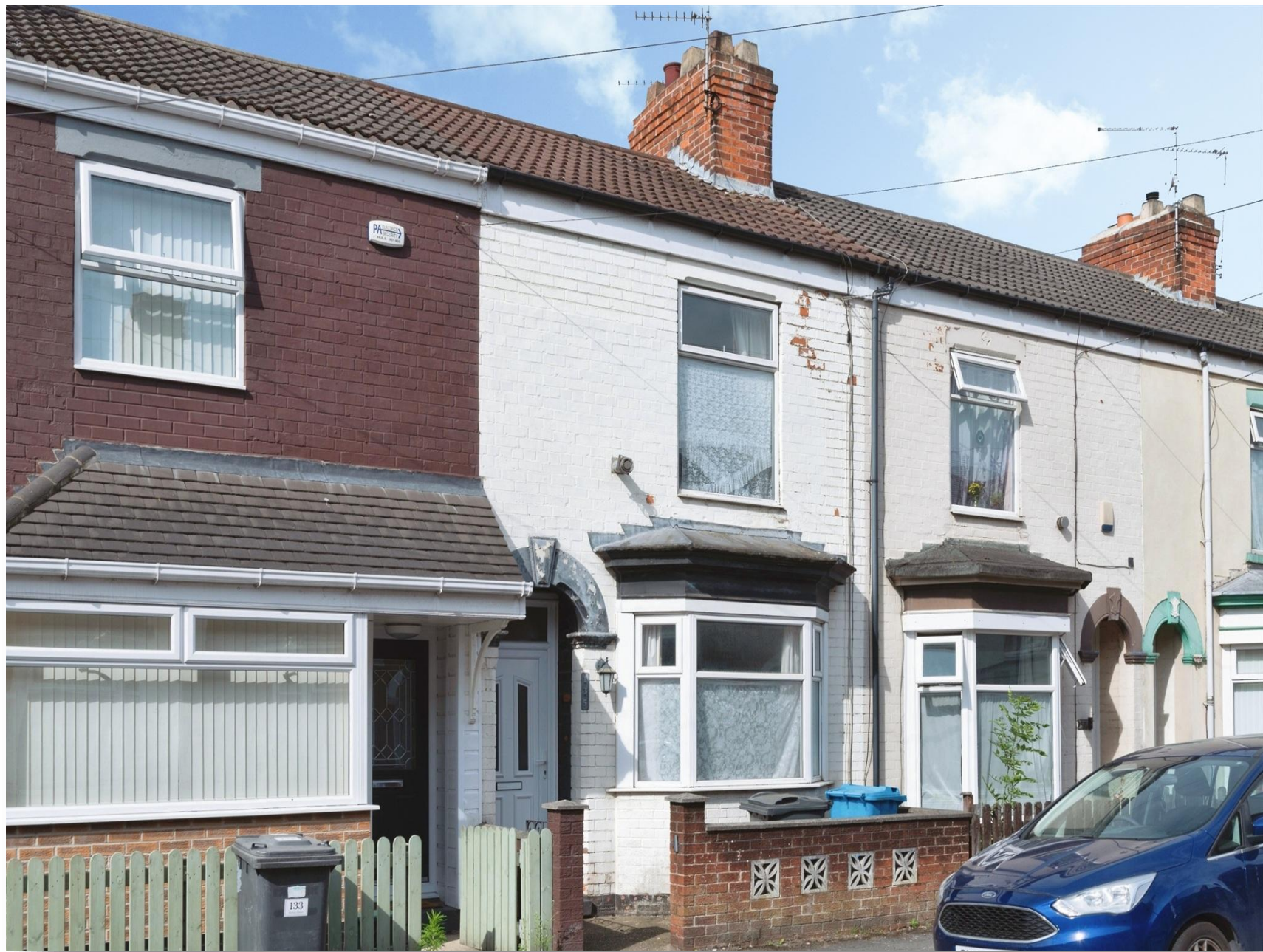
Mersey Street, Hull, HU8 8SE