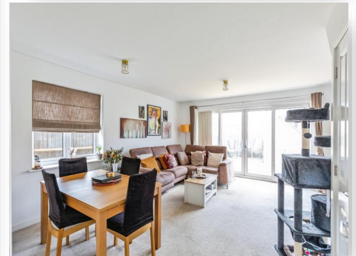
Sulgrave Way, Wellingborough NN8 1FG