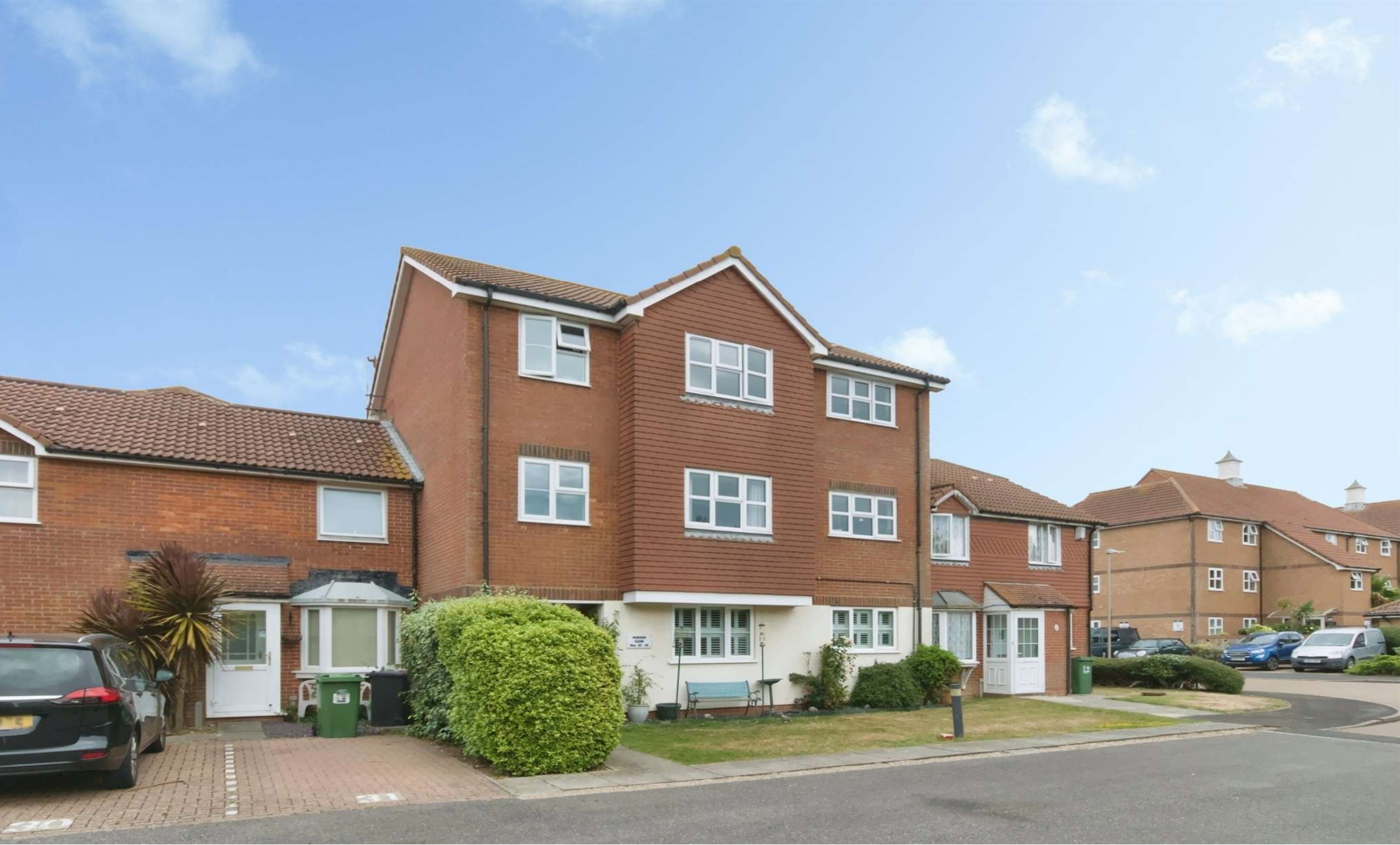
Hudson Close, Eastbourne BN23 5RB