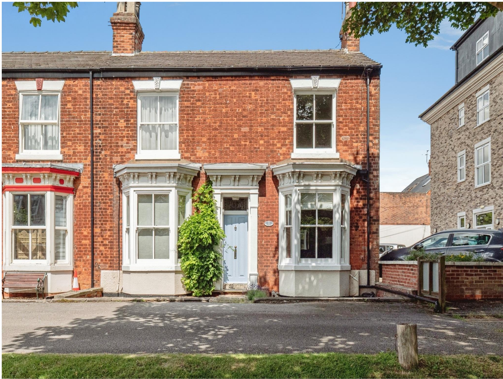
Wilton Terrace, Hornsea, HU18 1PX