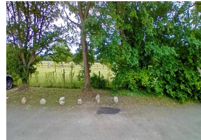
Lansdowne Road, Dry Sandford, Abingdon, OX13 6EA