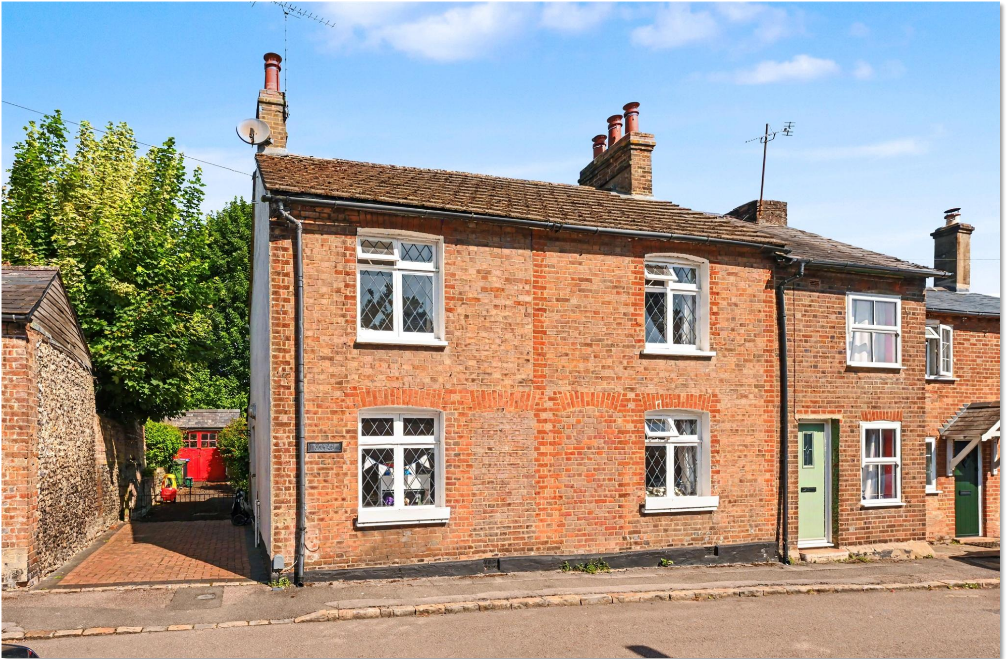
King Street, Tring HP23 6BJ