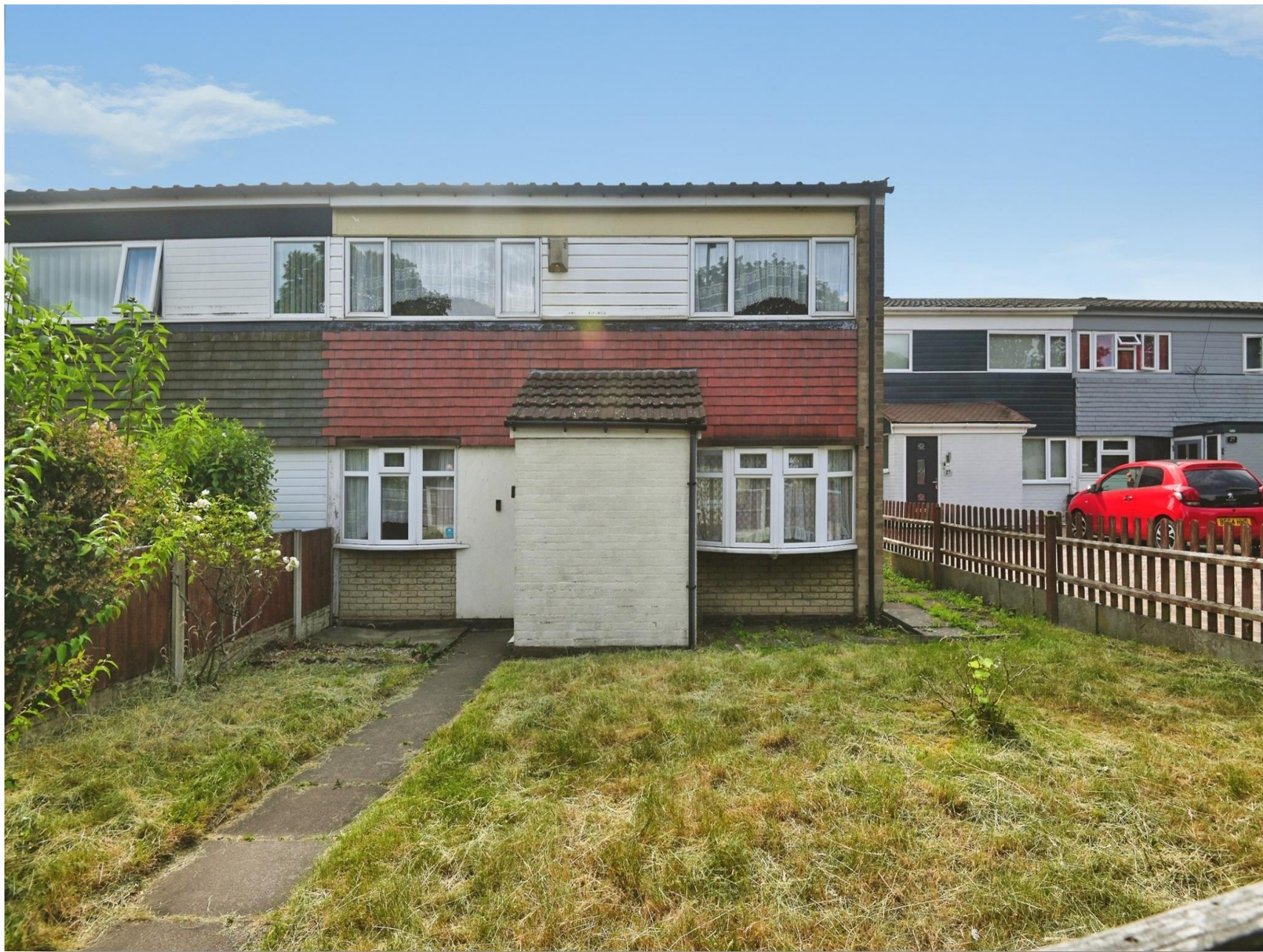
Moorend Avenue, Chelmsley Wood Birmingham B37 5SD