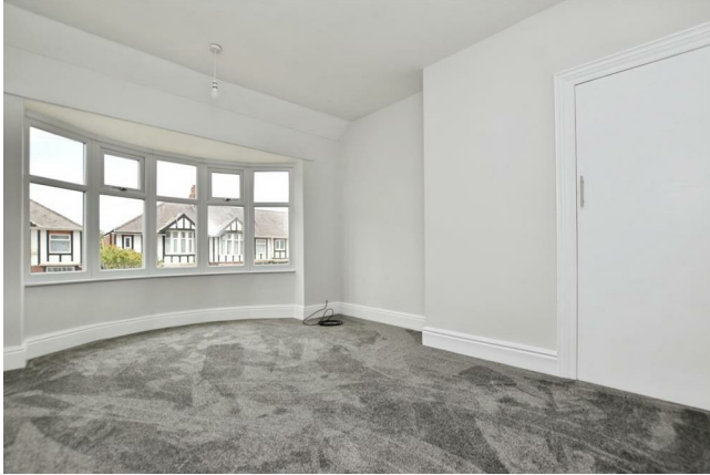
Bedroom One 11'2" x 14'9" (max) (3.42 x 4.52 (max))

A double bedroom with feature walk in bay window , enjoying views of the iconic light house. Radiator, useful storage cupboard and newly fitted carpet.