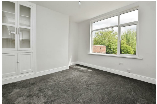
A light and airy dining room with large double glazed picture window enjoying views over the rear garden. Radiator and newly fitted carpet.