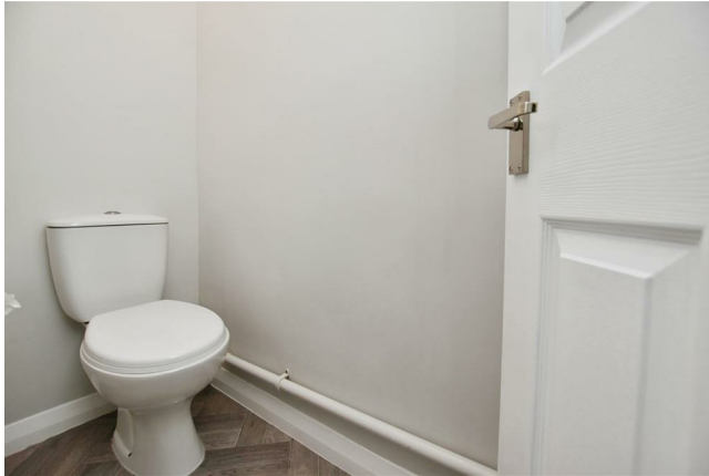
Ground floor W.C with toilet and wash basin.

Lounge 12'10" x 12'3" (max) (3.93 x 3.75 (max))