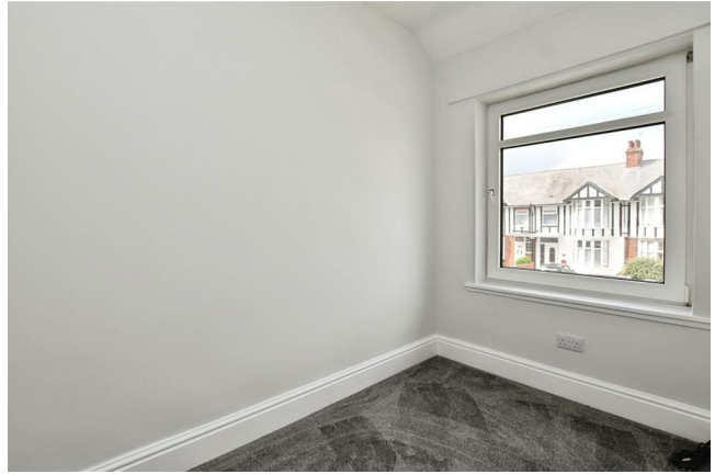
Bedroom Three 9'6" x 6'6" (2.9 x 2.0)

A single bedroom with double glazed window, radiator and newly fitted carpet.