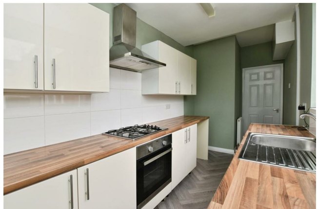
The kitchen has a range of modern fitted units to base and walls with complimentary wood block effect work surface and tiled splashbacks. Stainless steel sink with mixer tap and drainer. Space for fridge freezer and plumbed for automatic washing machine. Radiator, vinyl flooring and door to rear porch