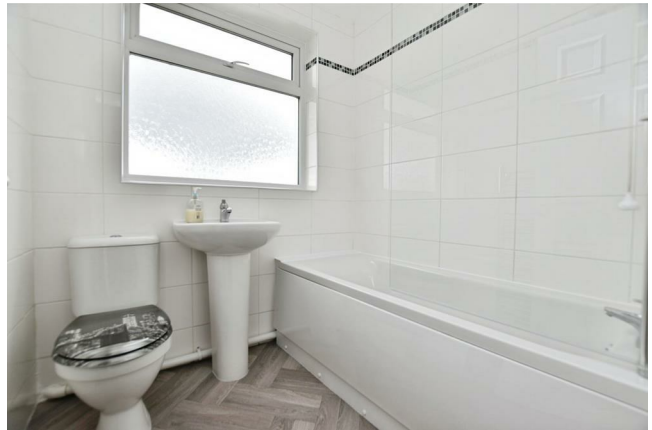
Bathroom 6'1" x 5'8" (1.86 x 1.74)

A modern bathroom with tiled walls and attractive vinyl flooring. Panelled bath with overhead shower and glazed screen, pedestal wash basin and low level W.C. Double glazed obscure window and chrome towel heater.