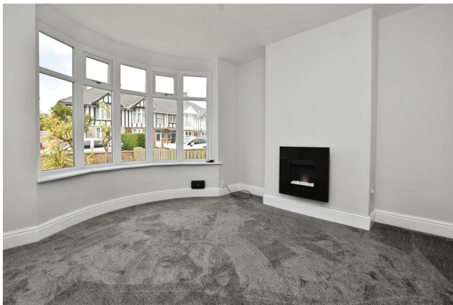
A light and airy lounge with feature fireplace and walk in bay window to the front elevation. Radiator and newly fitted carpet.

Lounge 12'10" x 12'3" (max) (3.93 x 3.75 (max))