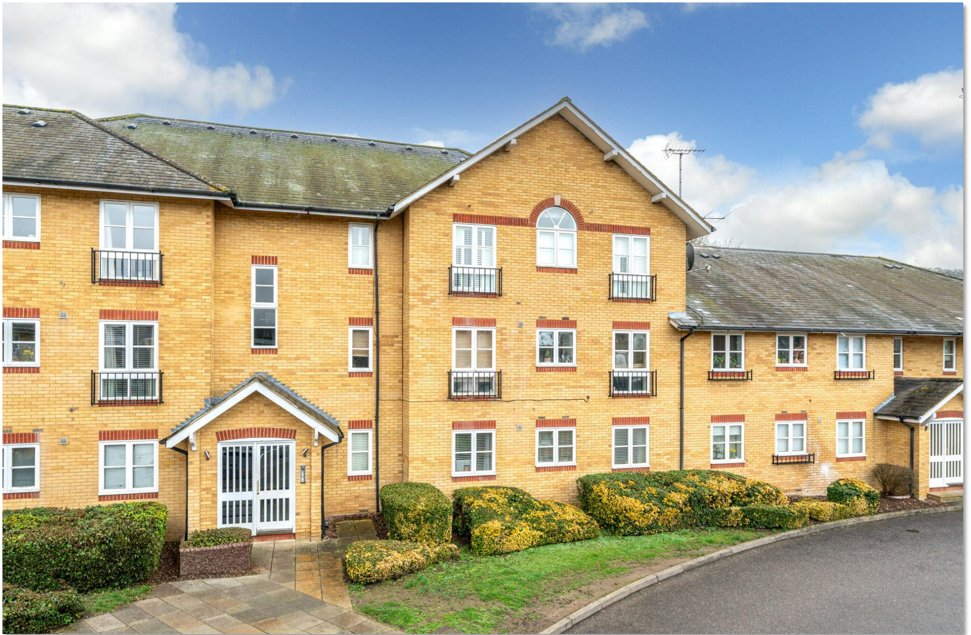
Alsford Wharf, Berkhamsted HP4 2BG