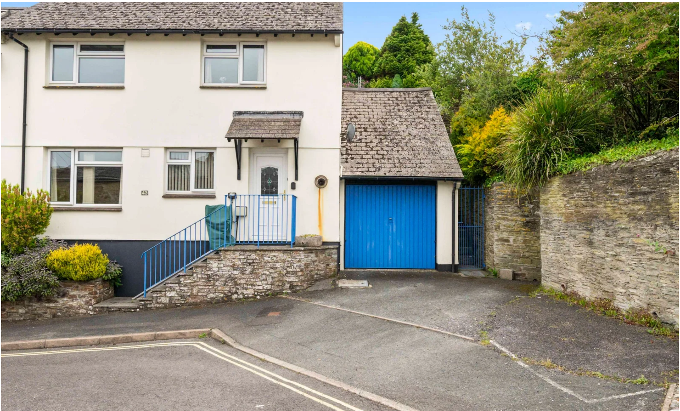
Ebrington Street, Kingsbridge Kingsbridge