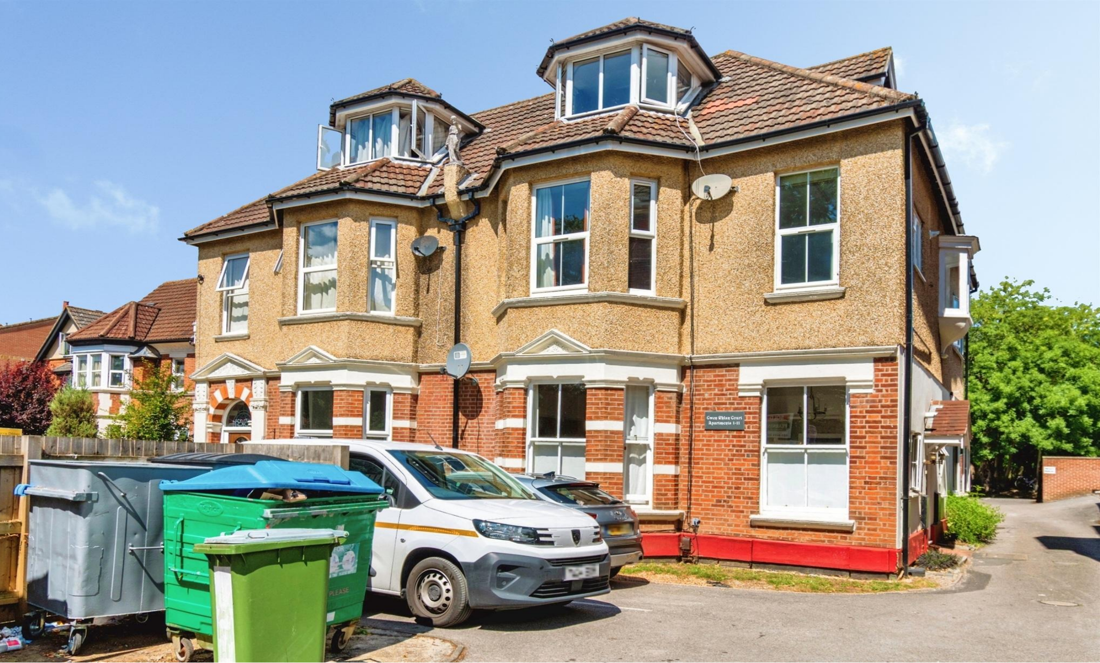
Gwen Rhian Court, Court Road, Southampton SO15 2JR