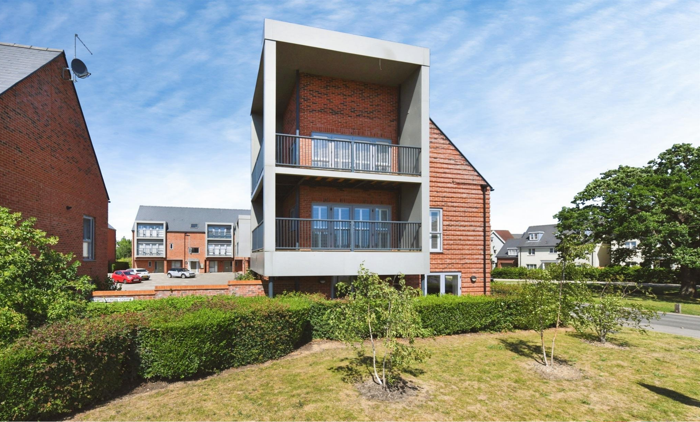
Harry Lemon Court, Chelmsford Garden CHELMSFORD CM1 6DU