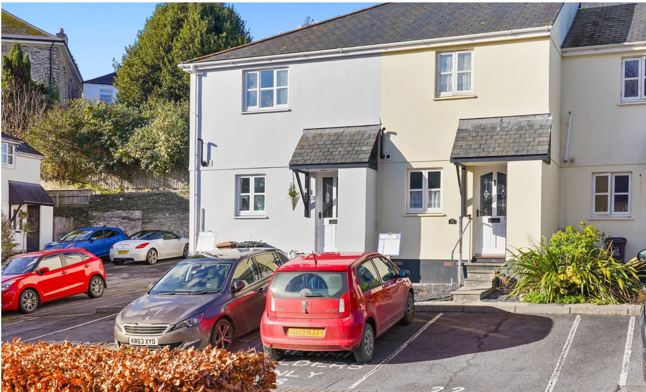
Church Close, Kingsbridge, TQ7 1BU Kingsbridge