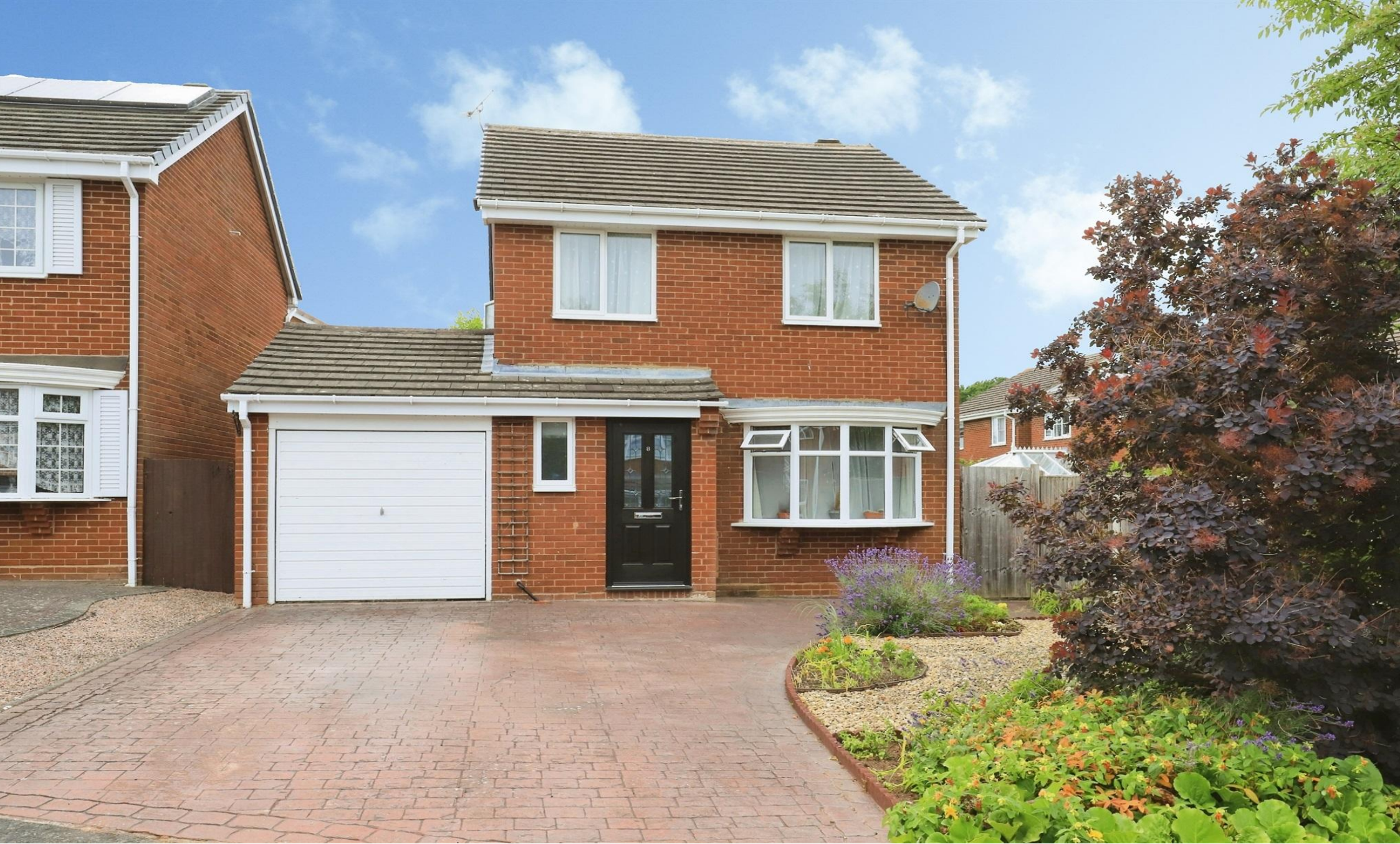
Jay Park Crescent, Kidderminster DY10 4JP