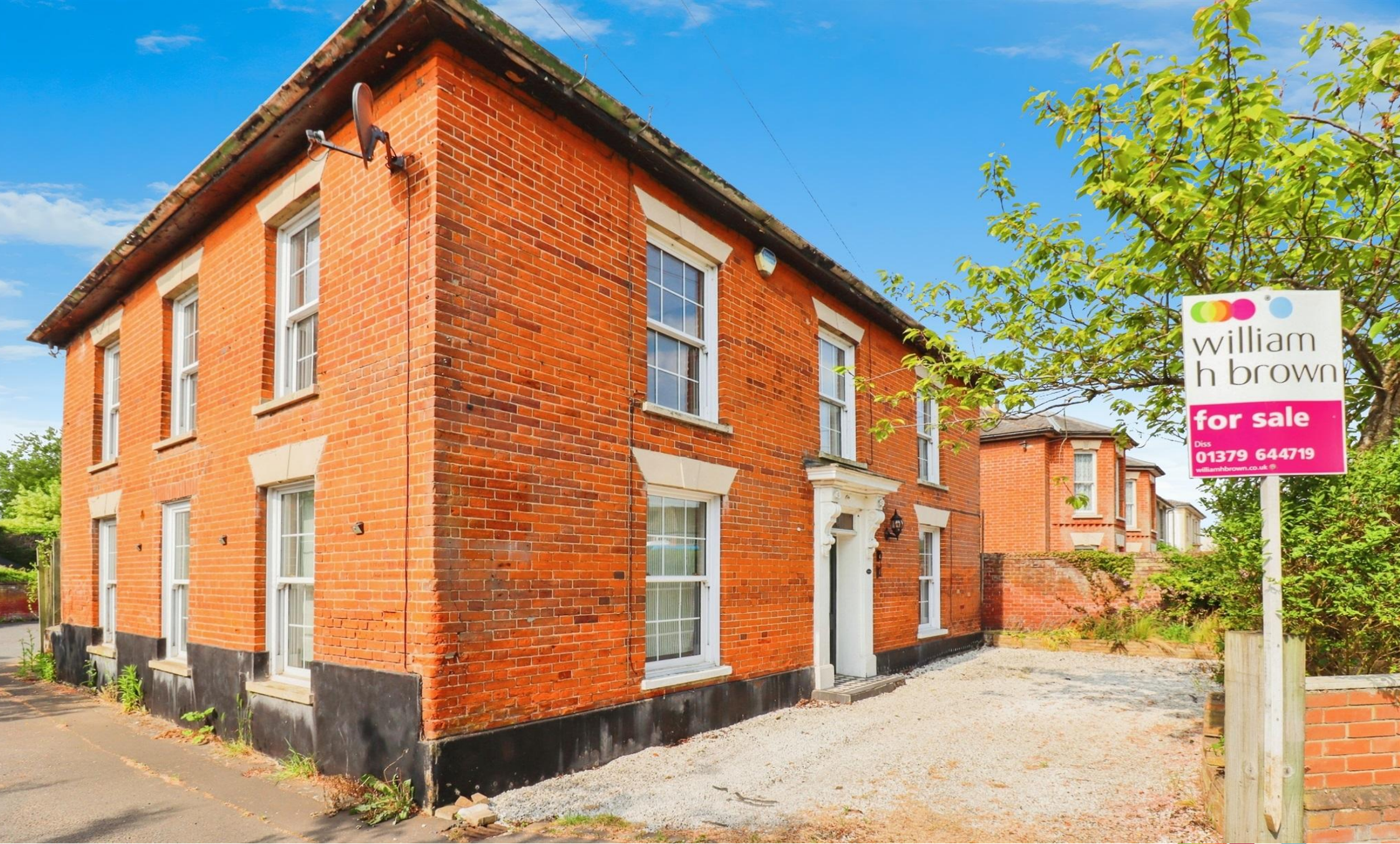
Lion House Victoria Road, Diss IP22 4JG