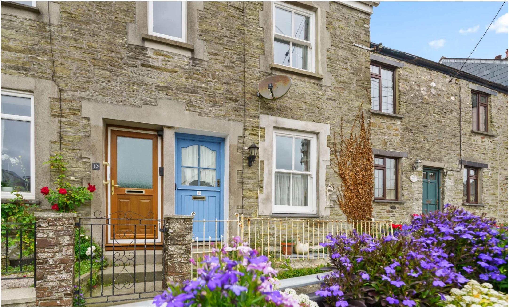
Fore Street, Loddiswell Kingsbridge