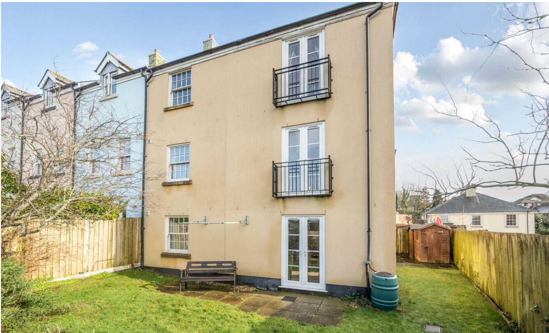
Scholars Walk, Kingsbridge Kingsbridge