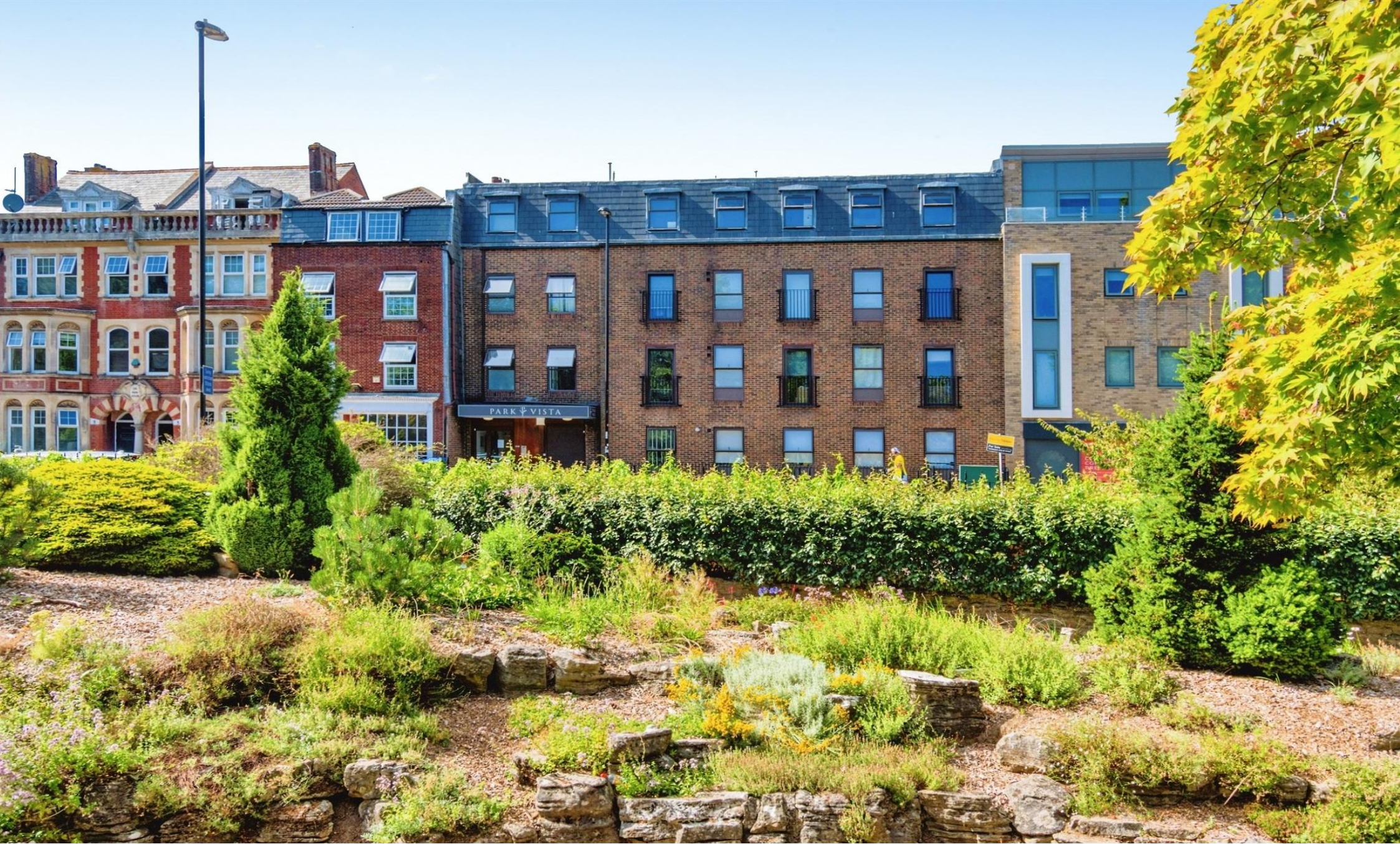
Park Vista, Brunswick Place, SOUTHAMPTON SO15 2AN