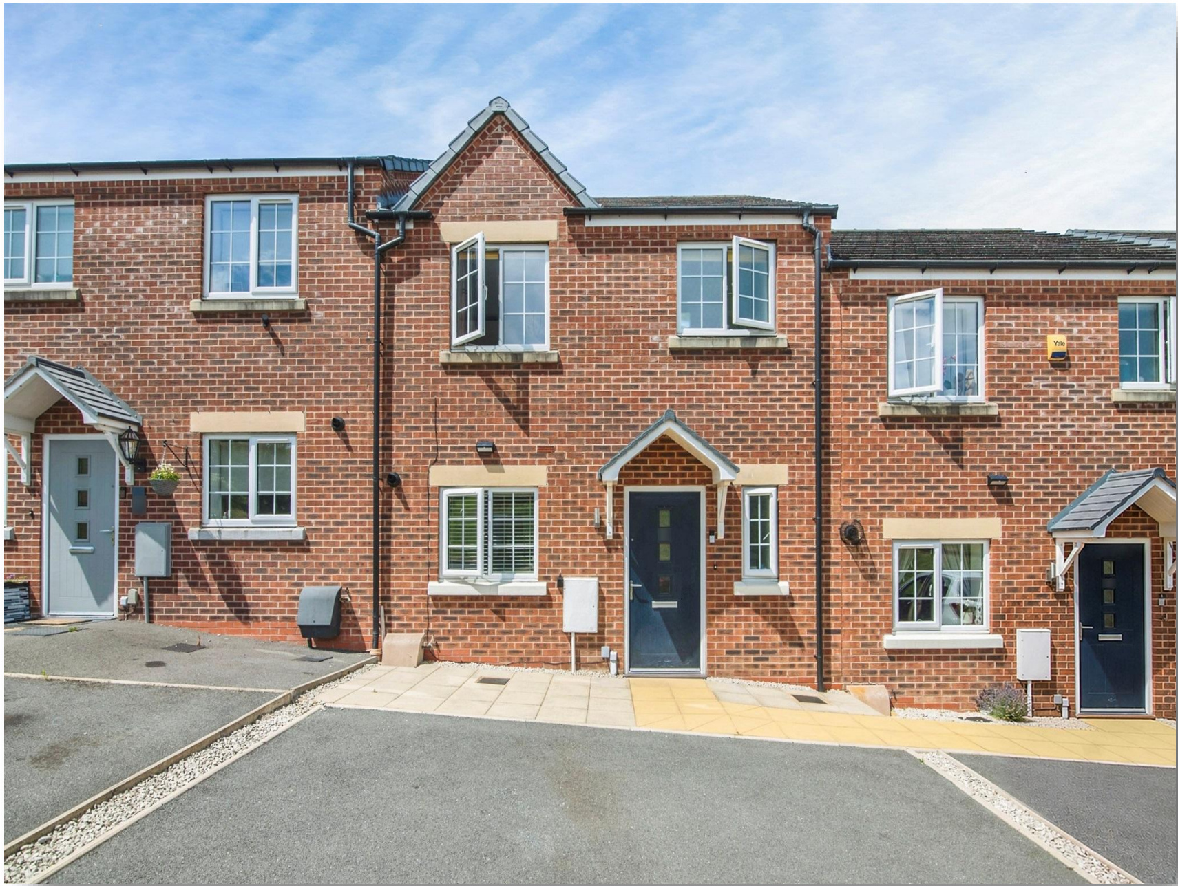
Messiter Way, Dudley DY1 4SY