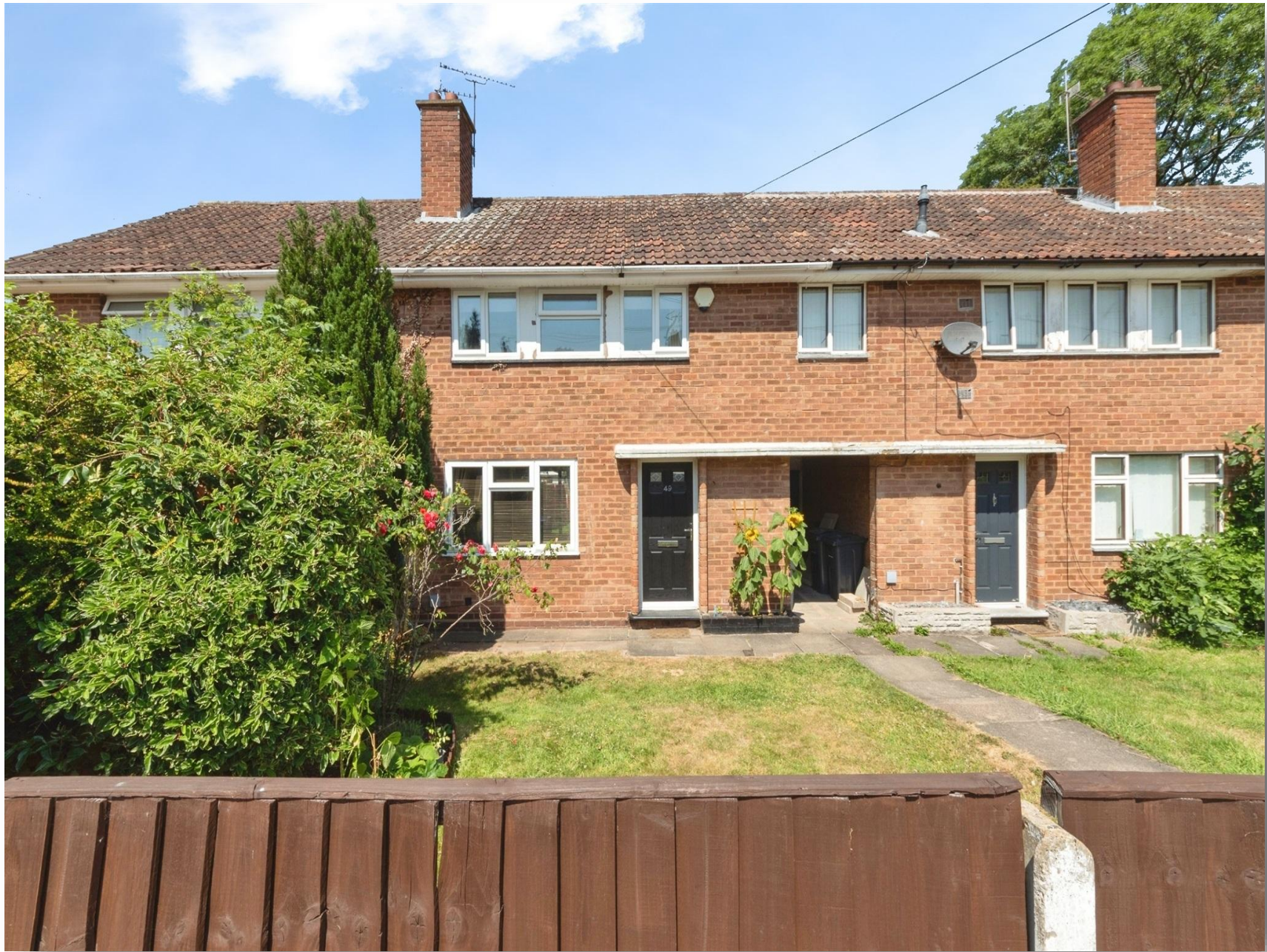
Shelfield Road, Birmingham B14 6JT