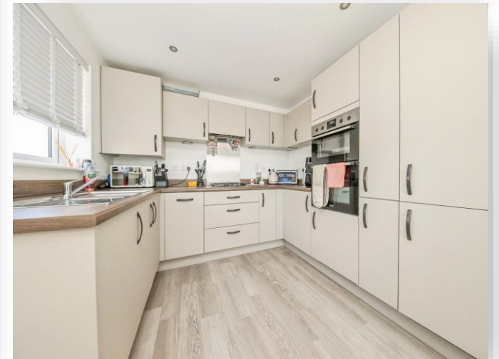
Northfield View, Sproughton, Ipswich, IP8 3FY