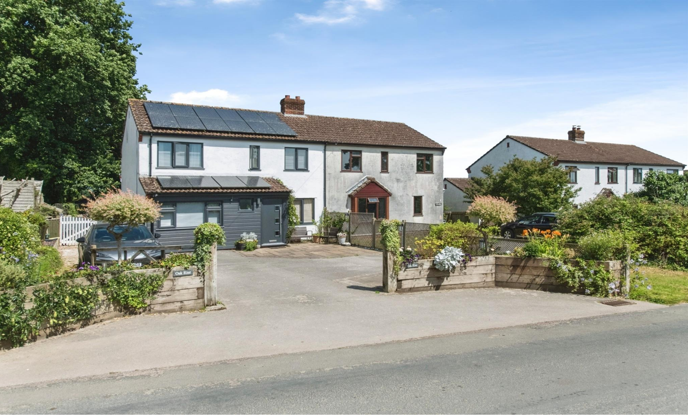
Oak Rise Smallridge, Axminster EX13 7JH