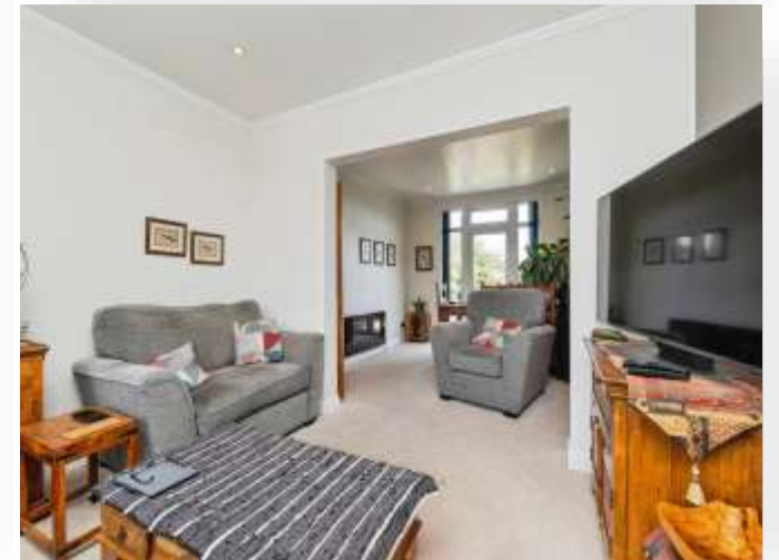
Broomhill Gardens, Hartlepool TS26 0JP